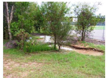
Study Area Complete

If you have and comments or concerns, please contact Allan Searant at asearant@optusnet.com.au