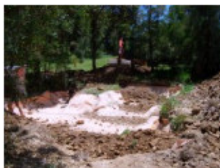
Lining of Wetlands Study Area