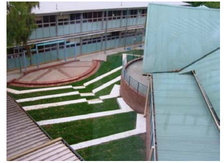
Performance Area Completed