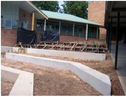
Early Days - More Work Required